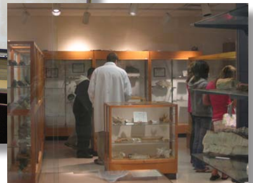
Breakout sessions at the Summit offer students the opportunity to learn about other exciting environmental projects and topics in Genesee County.