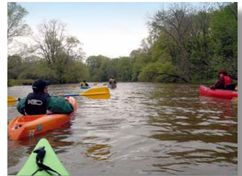
Genesee County community members learn about the watershed and water quality issues while having fun and relaxing in a kayak!