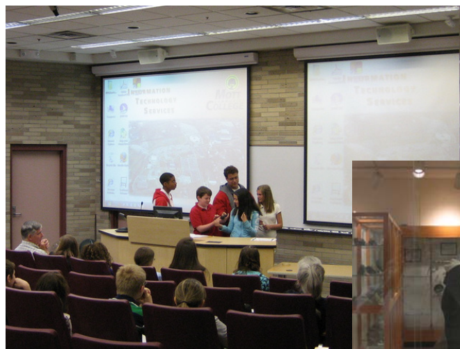
Students present their water quality monitoring research findings at the Flint River GREEN Student Summit.

You, through the Our Water program, support our partner the Flint River Watershed Coalition and Flint River GREEN - Earthforce, the Genesee Intermediate School District, General motors and a handful of others - to coordinate this applied curriculum. In Genesee County, the work done for Flint River GREEN provides information for the Our Water program to fulfill our requirements.