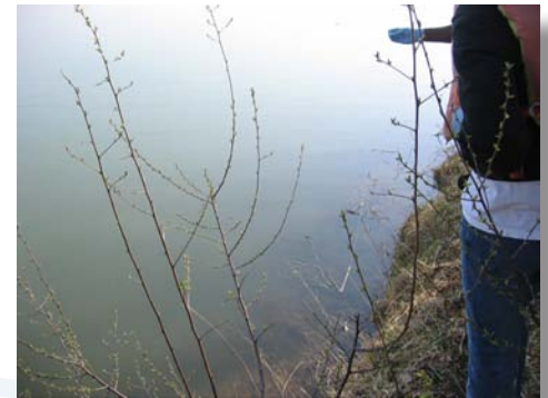
Students gain valuable experience applying knowledge learned in the classroom by conducting storm water awareness projects.

Available tools include EnviroScape Watershed Models, available for check out and use, with step-by-step directions for setup and cleanup, lesson plans and tips. Also included on the webpage are lesson plans for K-12 activities and service-learning opportunities related to keeping our water clean. Many of the lesson plans have the appropriate curricular connections, including Michigan Content Level Expectations, identified and listed.