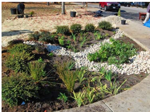
Bioretention areas, also called rain gardens, collect stormwater and filter out potentially harmful pollutants.

from the City through its installation of 86 rain gardens, a detention basin and seven underground oil-grit separator units. At this time, all of the major outfalls of the City's stormwater are being treated through one of these measures.