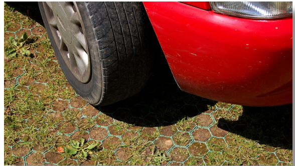
This driveway with permeable/porous covering helps reduce polluted runoff by allowing stormwater to soak into the ground.