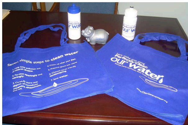
Our Water promotional bags, water bottles and piggy banks were used to draw visitors to the information booth at the 2008 Genesee County Fair.

This year, booth staffers kept track of where visitors live, to help us target educational needs. Maps of Genesee County were used to help visitors identify where they live in the watershed. Visitors also took a short survey to determine their knowledge of the watershed and their awareness of the Our Water Campaign. Of the 909 visitors, 99 (10.9%) completed the survey. For a full report on this survey, see the "Phase II Annual Report for 2008, Appendix F" on the Genesee County Drain Commissioner's Office Surface Water Management website: http://www.gcdcswm.com/PhaseII/AnnualReport/AnnualReport.htm .