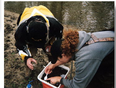
Two volunteers investigate the insects and other invertebrates living at the bottom of the stream.

Contact the FRWC at www.flintriver.org or (810) 767-6490 to participate in these programs.