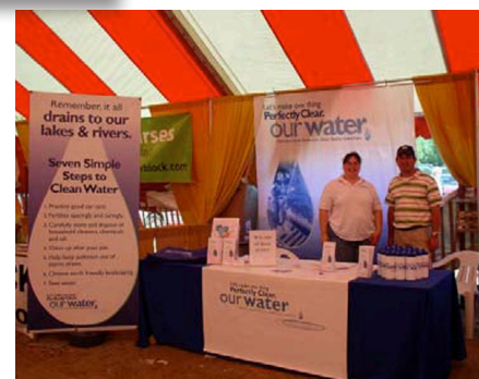
The Our Water information booth and the dedicated volunteers and staff that educated 909 visitors at this year's County Fair.

Booth staffers drew visitors to the tent with tote bags and coloring books. These items, and educational brochures, were given to any visitor who tried to answer a question